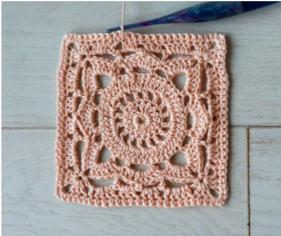
Willow Granny Square Pattern

Round 9 (Color C): ch1, 1sc in every st (pm on first sc st) around working 3sc sts in each corner ch2 sps. Join with a sl st to the first sc.