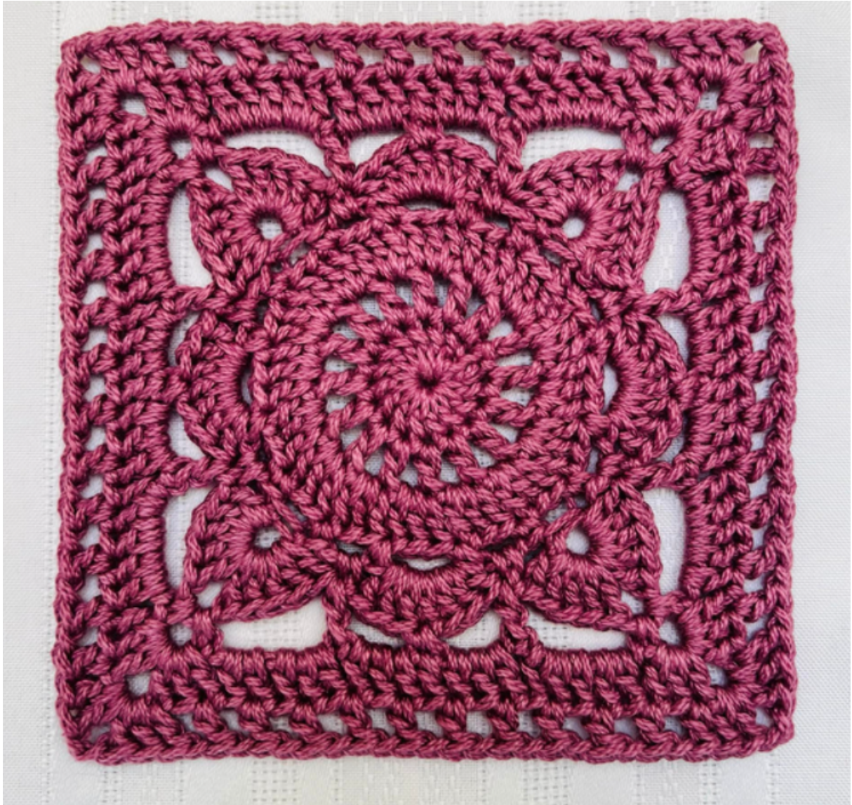
Willow Granny Square Pattern