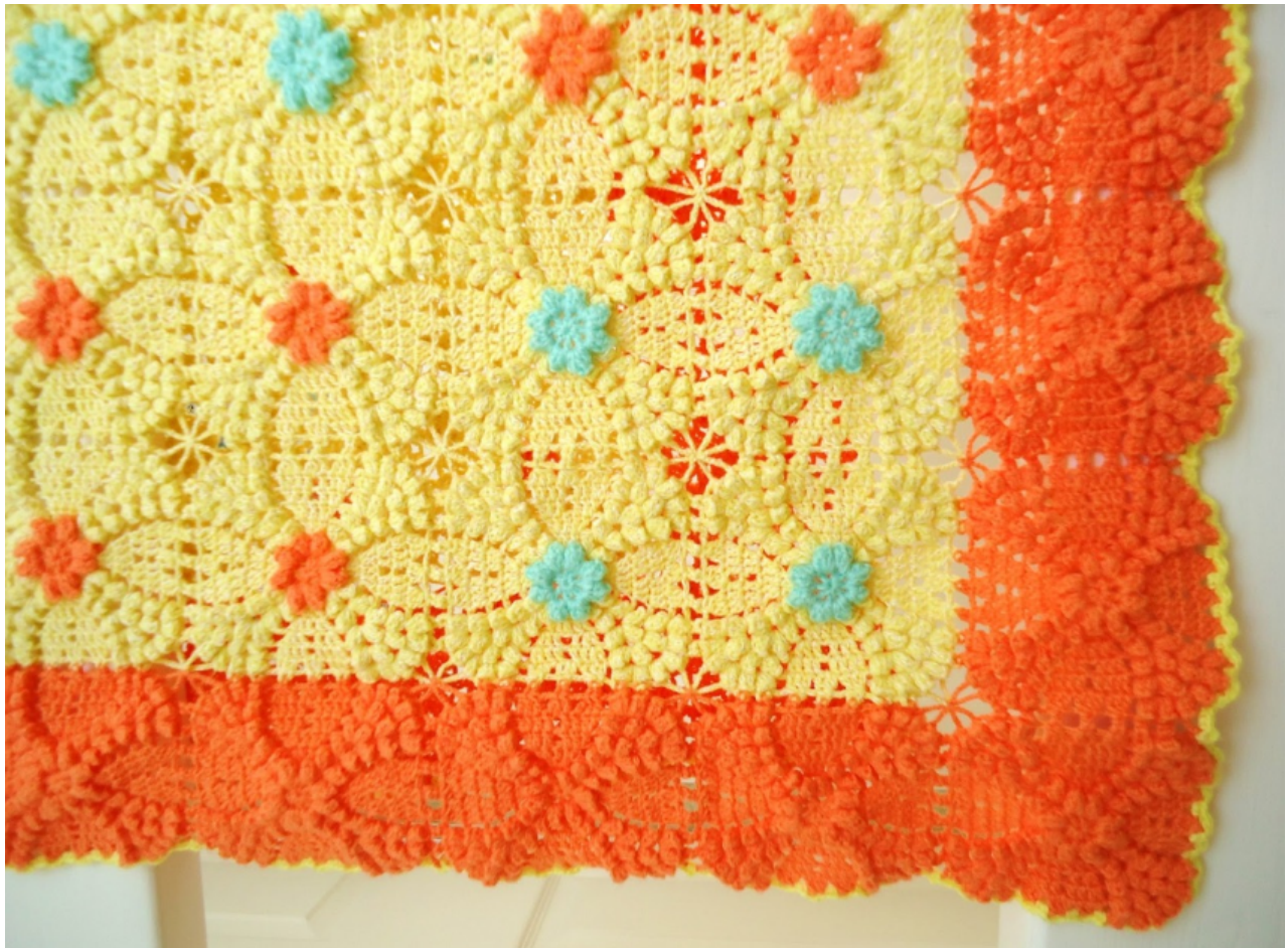
Vintage Wedding Ring Motif Squares Free Pattern