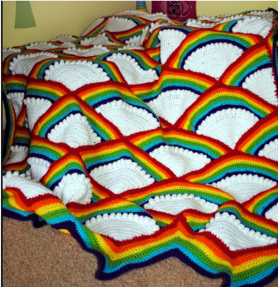
Rainbow Afghan Pattern