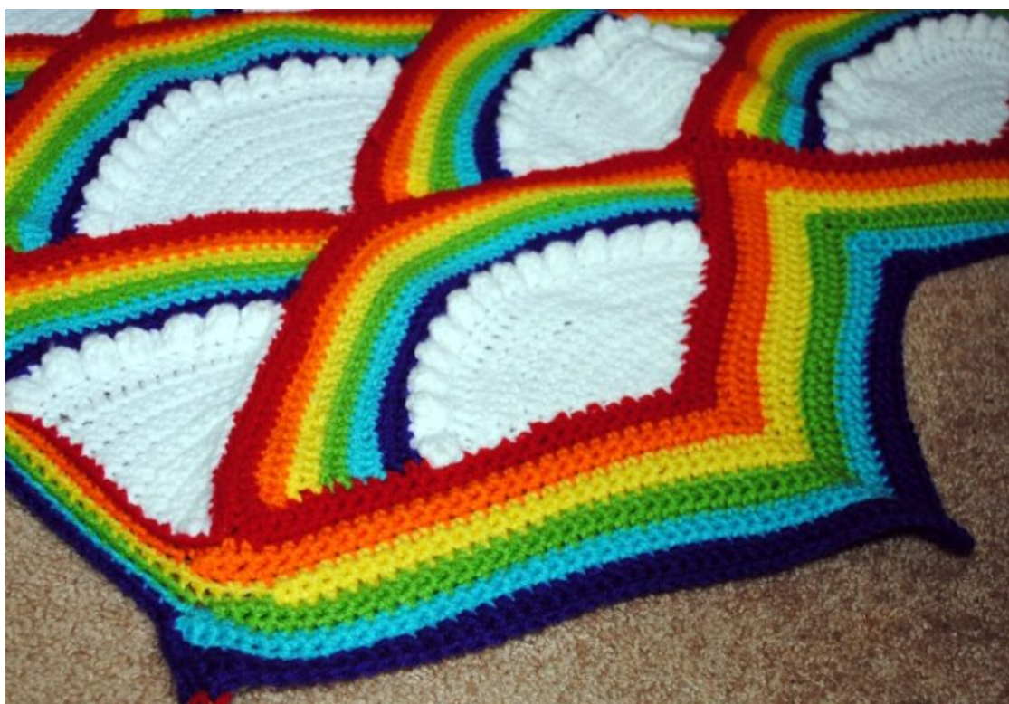
Rainbow Afghan Pattern

ROW 1: Sc in second ch from hook. ch 1 turn. hereafter ch 1, turn at end of each row unless otherwise stated.