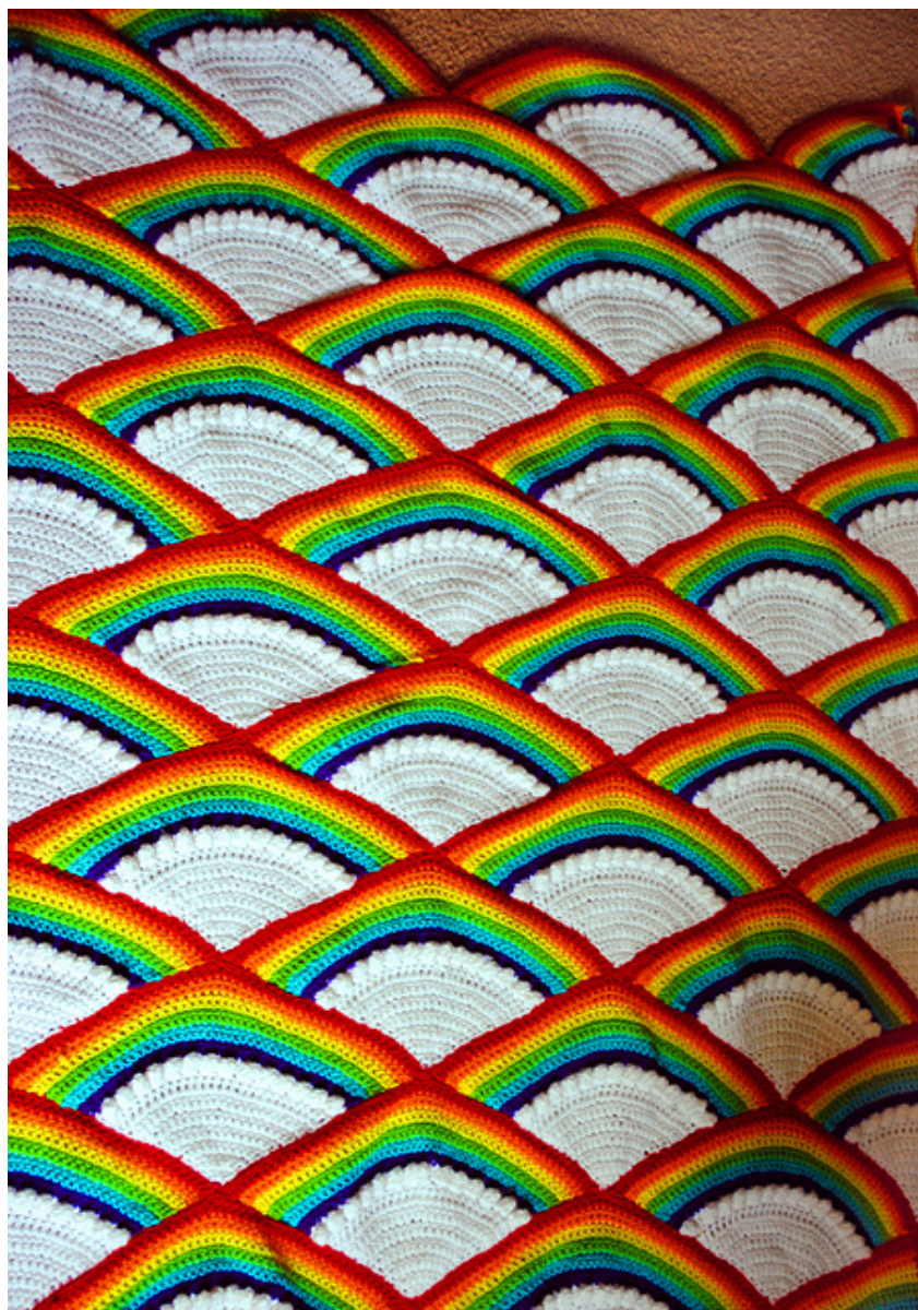
Rainbow Afghan Pattern

BLOCKING: Pin each fan to measurements on a padded surface: cover with a damp cloth and allow to dry; do not press.