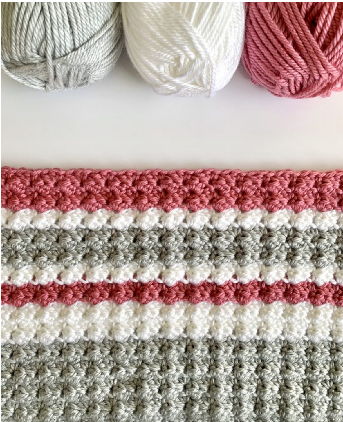
Crochet Sedge Stripes Baby Blanket